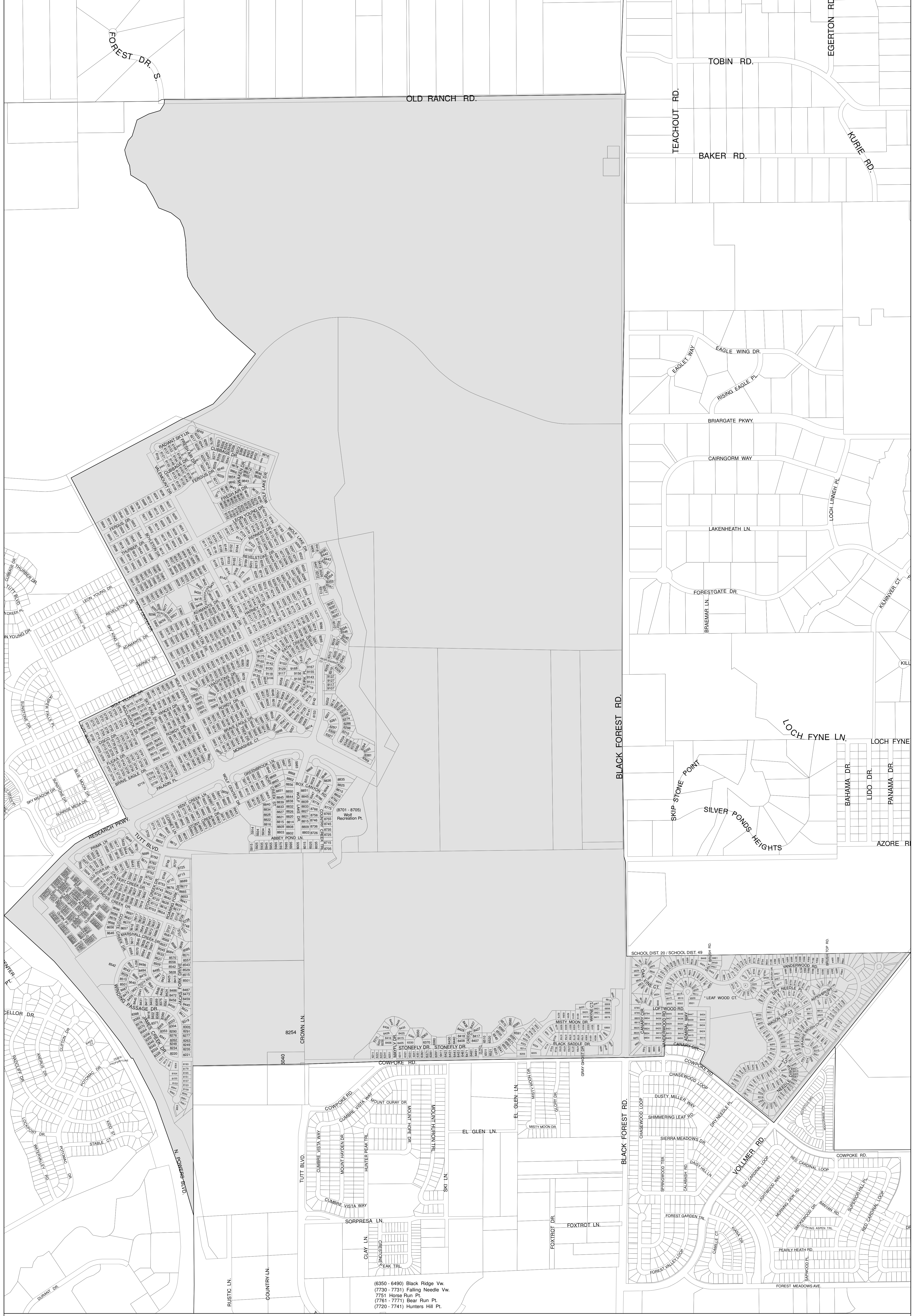
Map 1 of 1

COPYRIGHT 2017 by the Board of County Commissioners, El Paso County, Colorado. All rights reserved. No part of this document or data contained hereon may be reproduced, used to prepare derivative products, or distributed without the specific written approval of the Board of County Commissioners, El Paso County, Colorado. This document was prepared from the best data available at the time of plotting and is for internal use only. El Paso County, Colorado, makes no claim as to the completeness or accuracy of the data contained hereon.